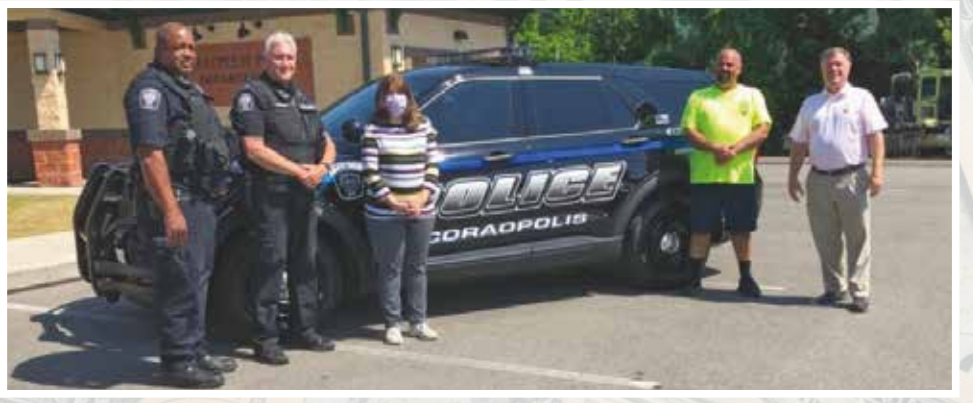
A $50,000 state grant awarded to Coraopolis police helped with the purchase of this vehicle.

This funding helps senior centers fund a variety of projects, such as updating and modernizing facilities, providing new health and entertainment programs, upgrading technology, and enhancing marketing opportunities.